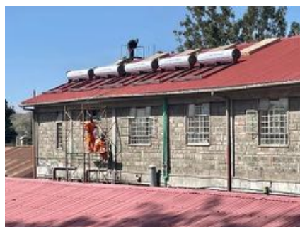
Solar Hot Water Installation