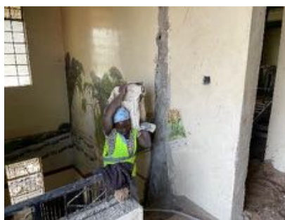
Women do the heavy lifting